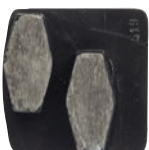
BAUTA Double Black S

If you want to create a rough surface with your grinding machine SC 650, you can use the BUSH HAMMER tool on 3 mm coating. The result can be compared to the surface after using a milling machine (scaryfier) or a blasting machine.