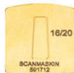
World Series Metal, 16/20